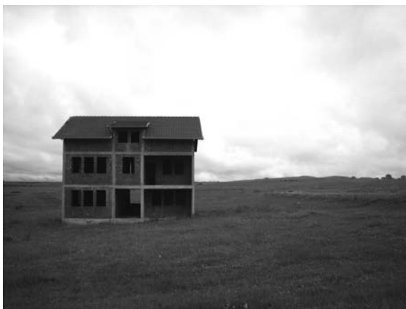
Priština/Kosovo, May 2006

Past, Present and Future Ethnographic Approaches to Universality