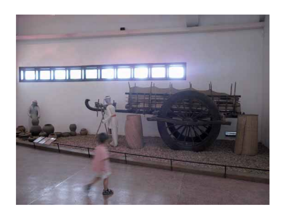
Picture 1: Water Buffalo Cart of Cham People at the permanent exhibition, ietnam Museum of Ethnology, 2009