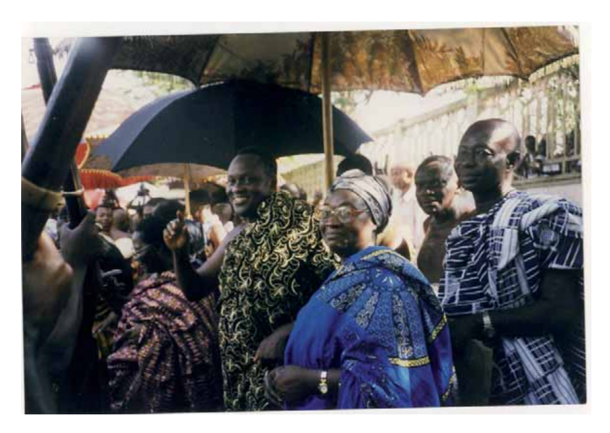
Figure #1 The Juabenhene (paramount chief of Juaben) and the Juasohemma (queen mother of Juaso at the launching ceremony of the Asantehene's Educational Fund.

the launching of the Asantehene's Educational Fund, held on the grounds of Manhyia where the Asantehene (king of Asante) and the Asantehemma (queen mother of Asante) have their palaces. Indeed, for the event the new, young Asantehene, Osei Tutu II, called all of the Asante chiefs together, and each of them was asked for a contribution or a pledge. Hundreds of chiefs attended with their entourages and an umbrella carrier to shield them from the tropical sun. A representative body from the government was present as well as several hundred chiefs with their entourage.