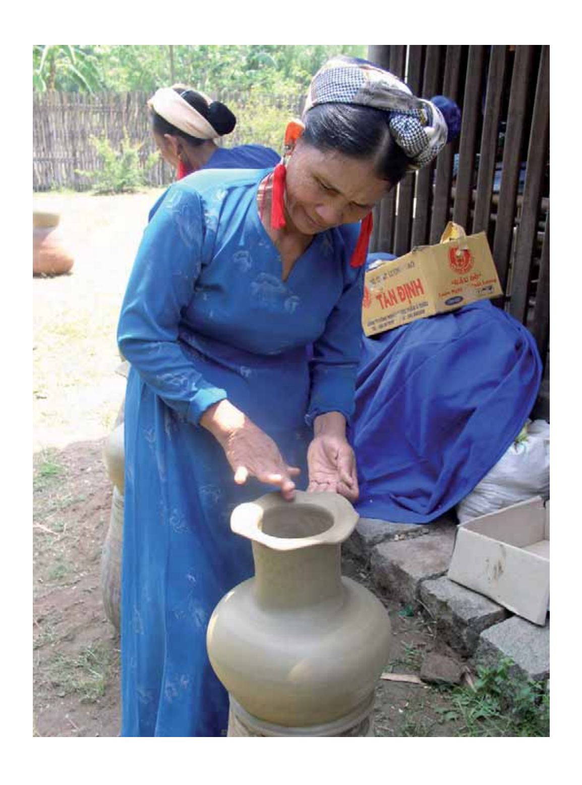
Picture 3: Cham women demonstrate pottery making at the Cham house, ietnam Museum of Ethnology, 2003