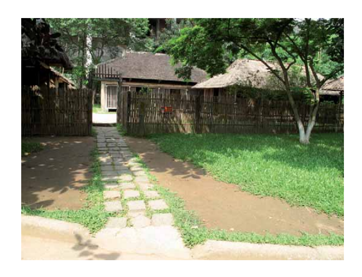
Picture 2: The Cham house complex at the outdoor exhibition, ietnam Museum of Ethnology, 2009