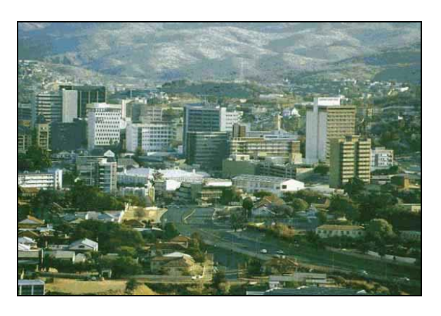
2012 Conference Theme

ICME will hold its 2012 annual conference on 12-14 September, at the Safari Court Hotel and Conference Centre, Windhoek, Namibia, in collaboration with the ICOM Namibia. Final details of the ICME conference are forthcoming; the general format of the annual meeting will consist of paper and discussion sessions and excursions to museums and cultural sites in the area. ICME/2012/Namibia will offer a great opportunity to showcase Namibia to an international audience of museum workers