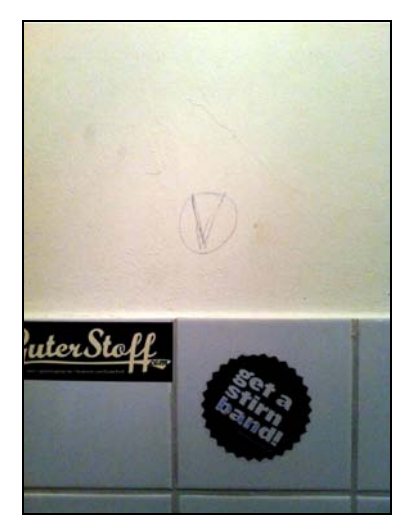
"V" a graffiti in the toilette of the bar "Tacheles", Vienna 11/2011