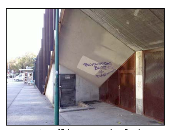
A graffiti, metro station Station "Thaliastraße", Vienna 10/2011