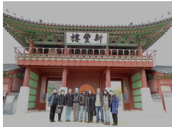
Suwon Hwaseong Museum

in the conference had a great opportunity to gain and utilize meaningful information and ideas on how they can apply intangible heritage in varied activities at the museums.