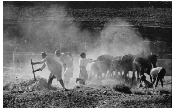
Morocco, Threshing with mules