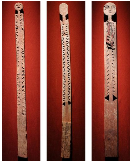
Three of the 30 totems, or vigango, that the Denver Museum of Nature and Science is handing over to the National Museums of Kenya.