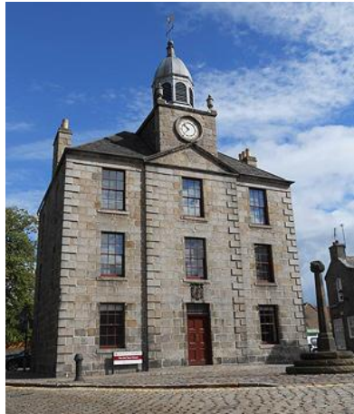
Kings Museum, University of Aberdeen

colleagues from across institutions and often provides insightful discussions among sector peers.