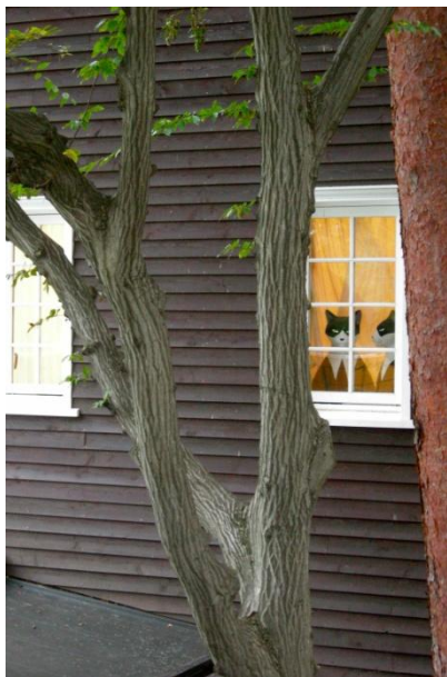
Happy New Year from Studio Ghibli