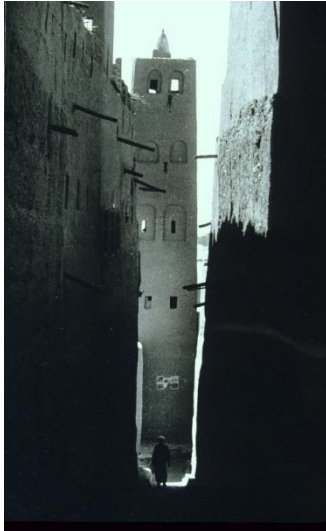
Amzru, man, minaret

resources is crucial for the survival of our species as well as others. It does not mean