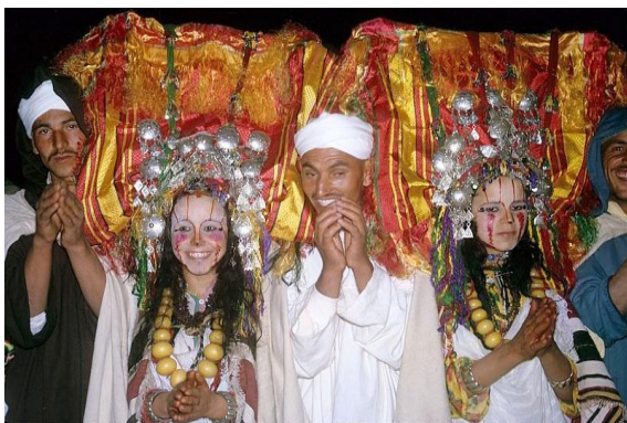
Brides, night dance, 1964

avoiding high tech where appropriate, but it does mean getting our priorities right, so we can prolong life on this planet and enhance it.