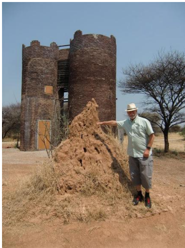
The author meets anthill.