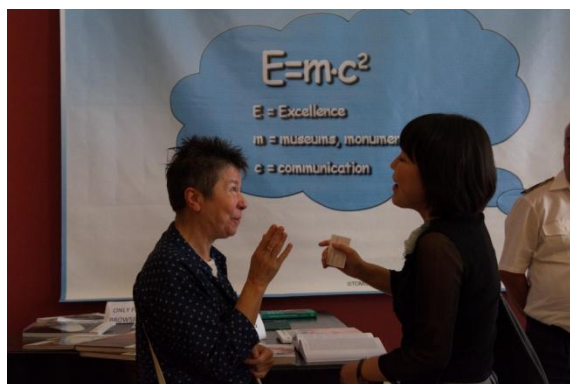
ICME President Viv Golding actively engaged in conversation.

The conference program was also enhanced by the eCultValue “Dialogue Day” sessions, in collaboration with European Museum Forum, at the Art Gallery Dubrovnik on the 19th, in which more than 50 participants shared new ideas and discussed the use of technology in the heritage sector.