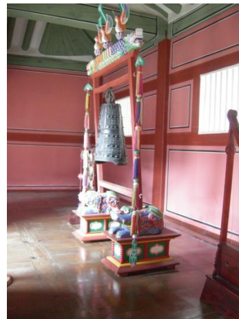
Bell in Seoul