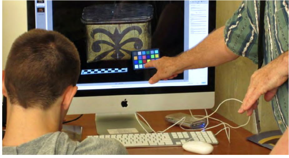
Workshop at NMAI 2