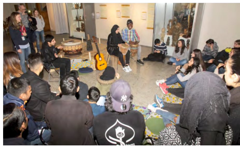
[Fig 2 The exhibition in action]