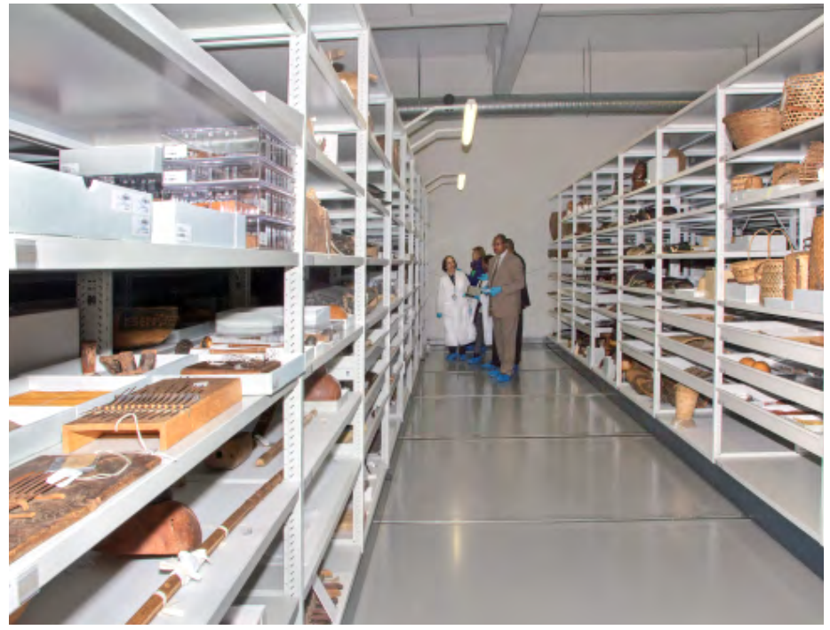
[Fig 1 Searching for Objects in the African Storage]

The first contact between Congolese living in Norway and the museum was established by the Nordic Exhibition Traces of Congo in 2007. Since then, cooperation on activities in relation to