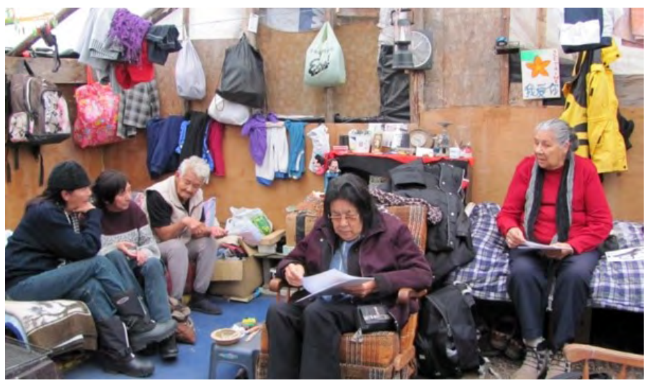
Sharing with elders