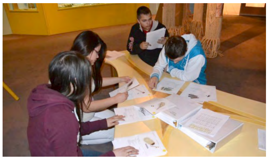
Workshop with youth

First, I retraced the life stories and knowledge associated with those objects. I consulted Speck's archives and publications in which I found details about composition, usage, or the context of collection. Then I cross-referenced this information with an ethnographic compilation of Ilnu memory and knowledge.