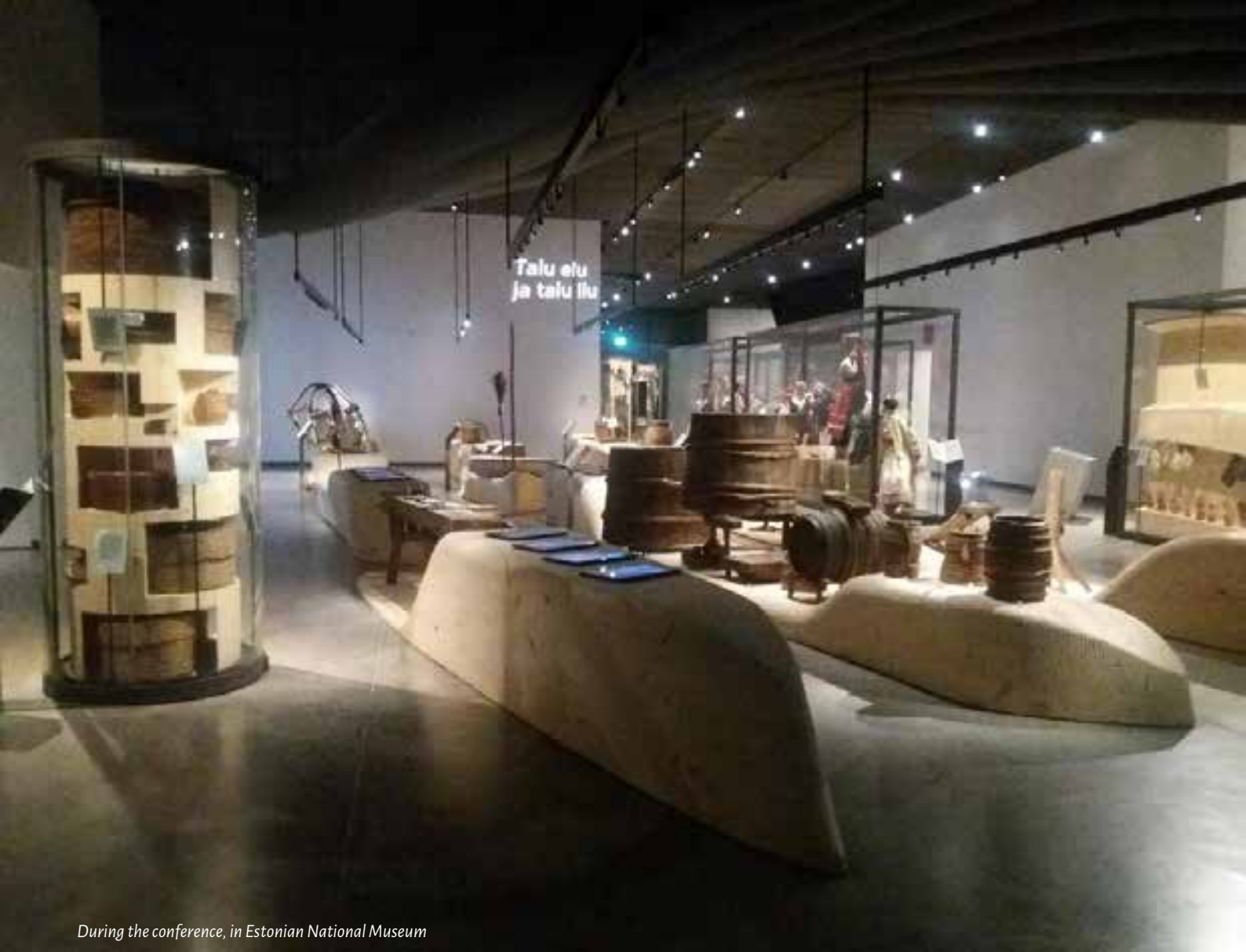
During the conference, in Estonian National Museum

the same. The conference and tour certainly showed me the possibilities for display and strategy in small museums with small budgets.