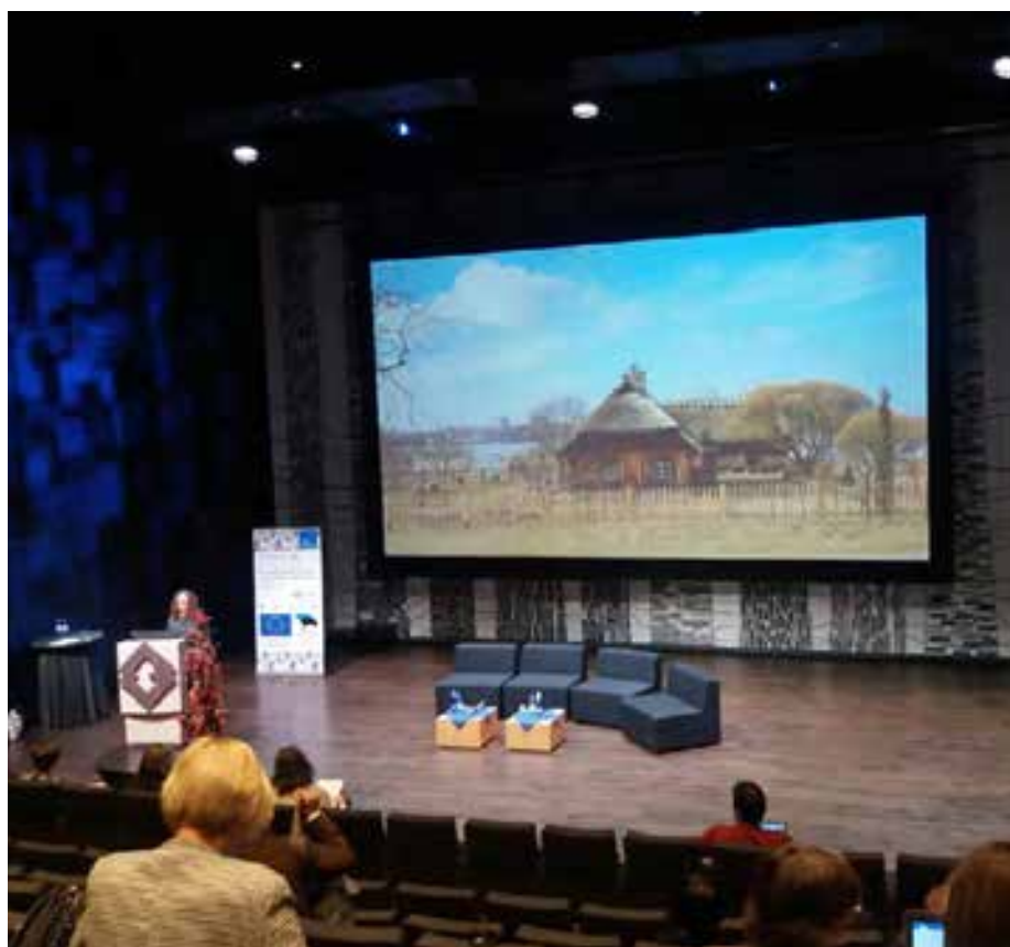
During the conference, in Estonian National Museum

which visitors can be curious about and understand the exhibits. As a result of economic growth, cultural heritage storage is being improved. In some developing countries, cultural