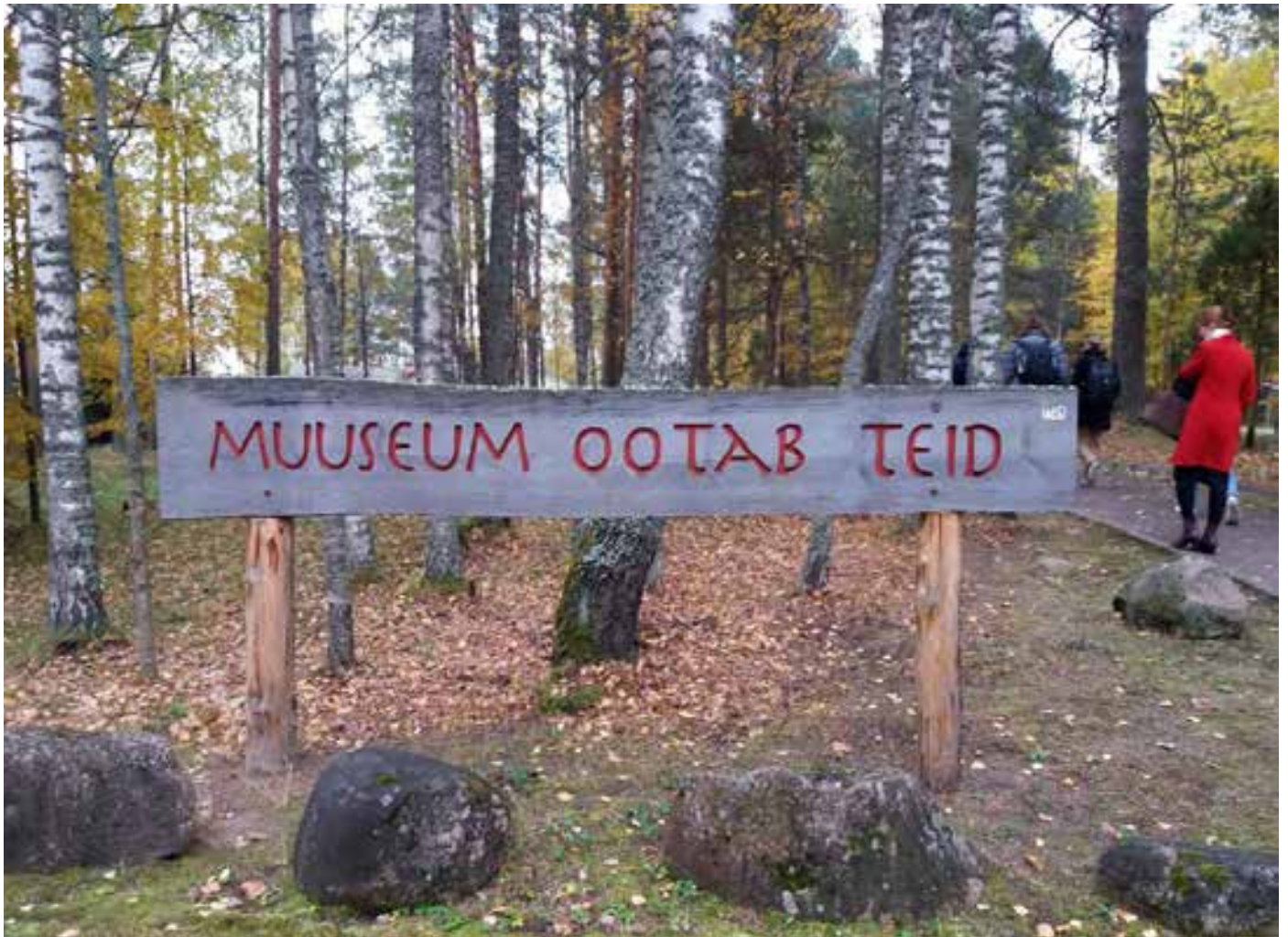
Setomaa and the Obinitsa museum in Estonia