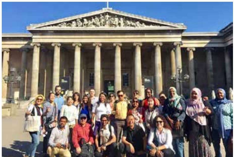
ITP 2018 Fellows