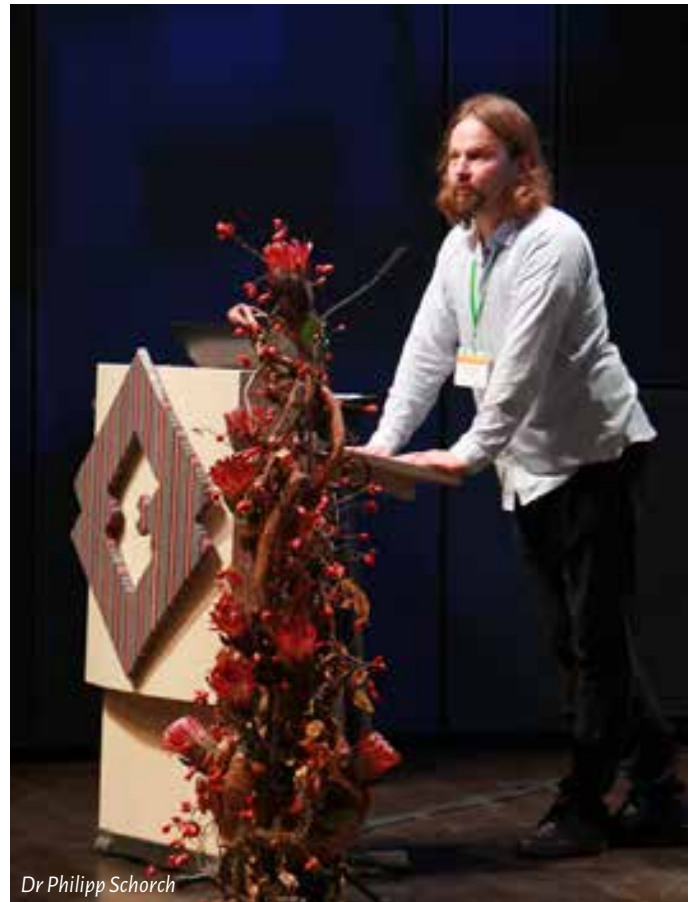
Dr Philipp Schorch

partments and collections and a cultural heritage study center. Encounters is one of the permanent exhibitions of the Estonian National Museum, presenting everyday life and culture in Estonia in different historical contexts. The exhibition is organized as a plurality of interpretations of various aspects of the everyday: language, housing, statehood, food, trade, and religion, introducing many personal stories related to specific objects that show how important historical moments are reflected in life or people through the interaction of the natural environment, social structure, traditions and creativity. The design of the exhibition is an interesting combina-