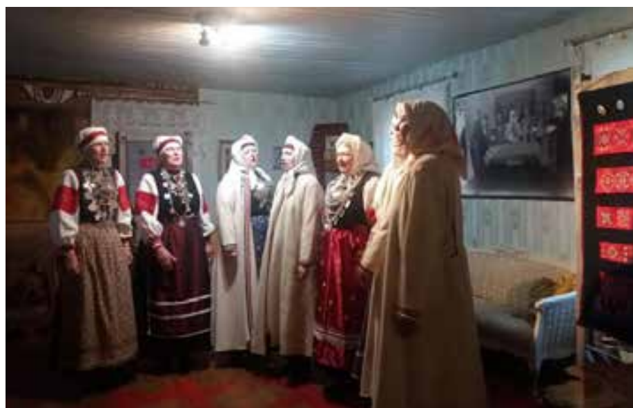
Setomaa and the Obinitsa museum in Estonia