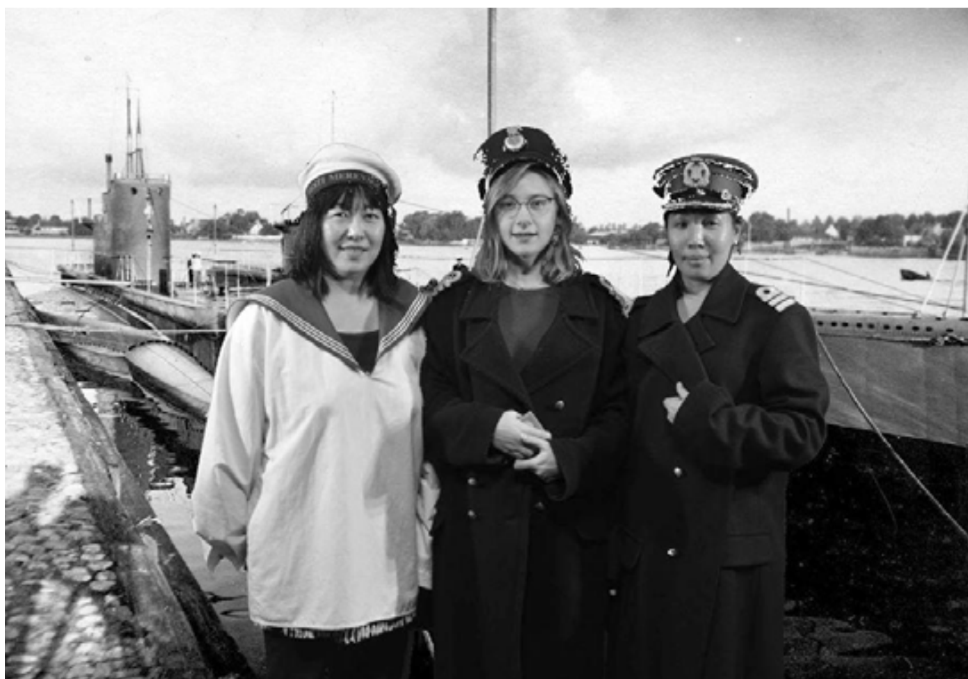
Estonia Seaplane Harbour (Estonian Maritime Museum)