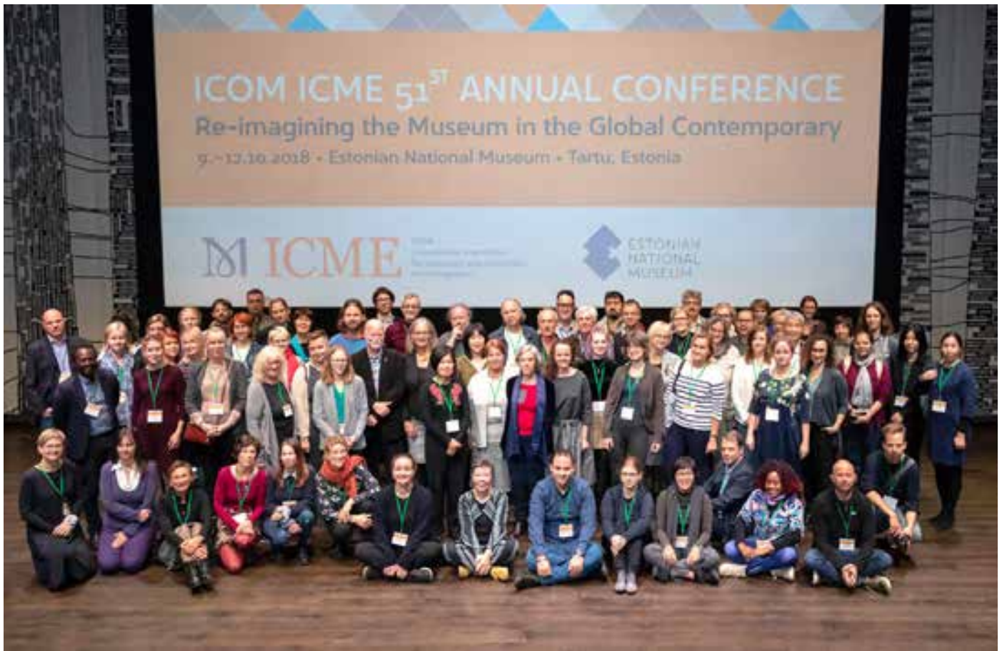
ICME 2018 participants.