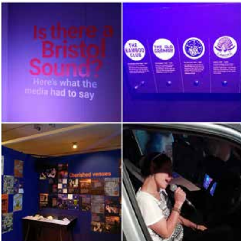
above: Street art in Bristol below: Exhibition Bristol Music

Besides offering experience in the different fields of museums, ITP also broadened my views and I learned to look at things from a wider and more international perspective. ITP helped me to strengthen my global networking.