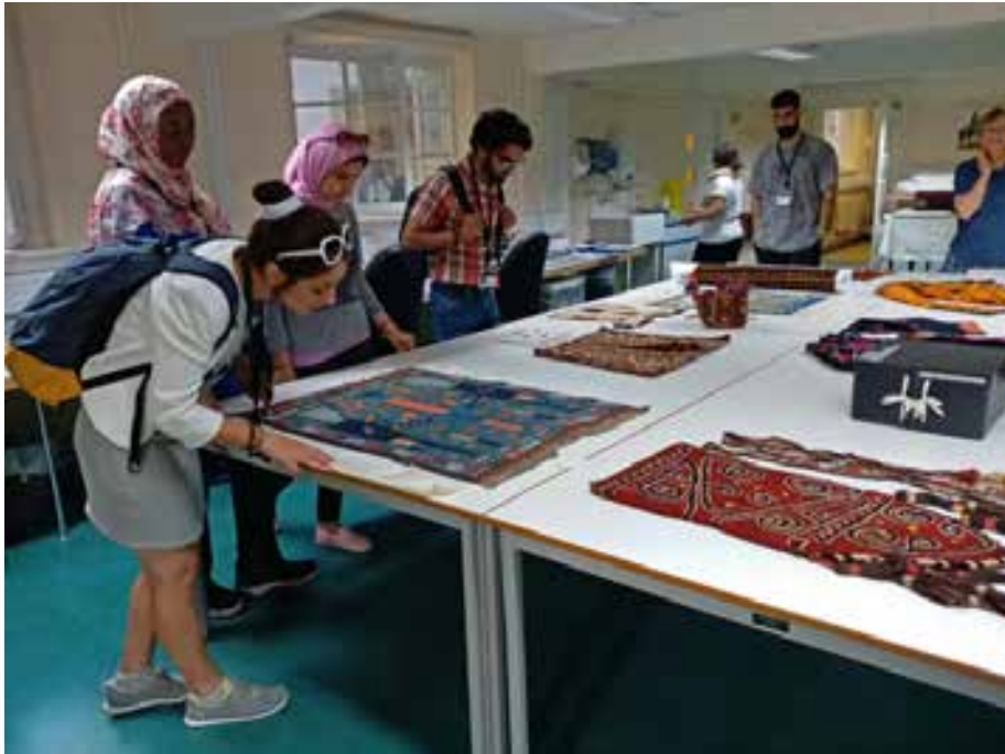
Session at the Blythe House, the British Museum's textile collections storage