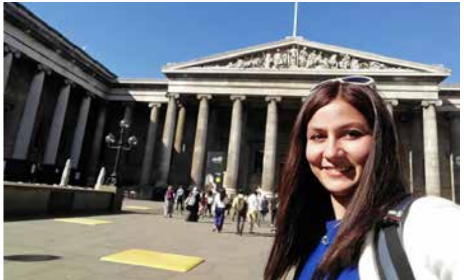
My first day at the British Museum

Since founding of the ITP in 2006, 276 fellows from 43 countries have taken part. I am honored because this year I became Azerbaijan's first representative on the Programme, among twenty three representatives from seventeen countries (i.e. Azerbaijan, Myanmar,