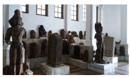
Figure 3 is taken on the other side of the Ganesha providing a view of the central left section of the rotunda. To the right of the Shiva sculpture is the Cane Inscription (Inv. No.D 25) which was King Airlangga's first edict dated 27th October 1021 and probably from Surabaya. To the right of the Vishnu sculpture is the Biri inscription (Inv. No. D 1) probably from South Kediri and perhaps from the late 12th century.

Ganesha's left and right in the background are both from Candi Banon (of which no trace remains). To the left is Shiva as Mahadewa (Inv. No. 23a/4341) and to the right is Vishnu (Inv. No. 18e/4847) both being dated as from the 8th-9th Century.