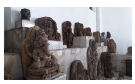
Figure 8 provides a view of the left back section of the rotunda just right of Figure 7.

Next, Figure 8 shows the view from the Biri stele towards the back left corner alcove of the rotunda. And it is in that context that Figures 9 and 10 provide close ups of two unusual sculptures though I could have chosen any number of others. The point here is to bear in mind that it is precisely such lesser works that tend to get passed over in publications and research though they are of exceptional interest in many ways in their own rights, even those of the roughest or unaccomplished sort.