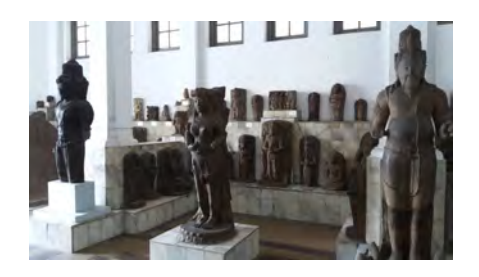
Figure 5 presents a view of the center right section with the three large standing sculptures from right to left being the Agastya from Banon, a sculpture said to be that of Queen Suhita of the Majapahit Kingdom (Inv. No. 6058). From Padi Jebuk in Punjul, Kelangbut, this sculpture is dated to the 14th to 15th Century. It is especially well known because of the typically careful Majapahit period depiction of jewelry and textiles, hairstyles and other accoutrements - and in this case especially for the high relief botanically accurate carving of lotus plants on the

back side of the sculpture. On the far left, the third large standing sculpture is a representation of Brahma (Inv. No. 15). It is also from the temple at Banon and dated to the 13th to 14th Centuries.