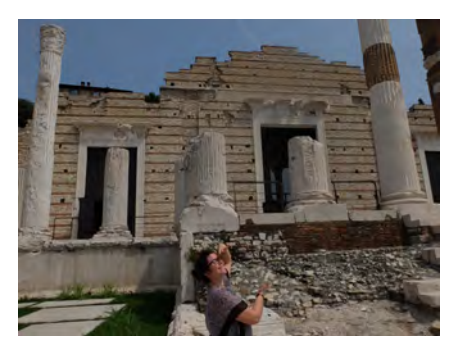
EarthQuake, Italy, 24th August 2016: In memory of the victims and their famillies, for the heritage destroyed.

First of all, I would like to thank ICME for trusting me and offering me this great opportunity.